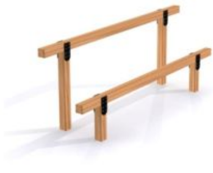
710682 x 2 Tripp trapp