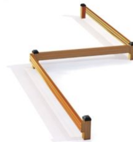
710690 x 2 Balansgång