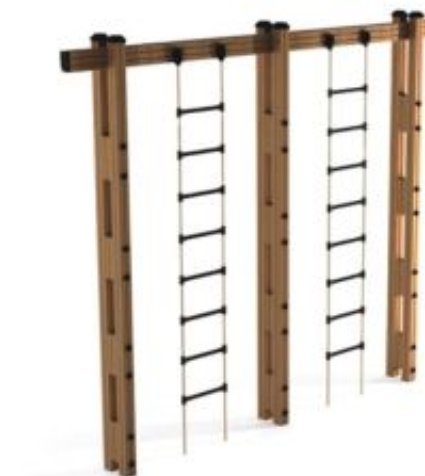
710647 Repstege dubbel