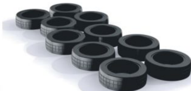
710687 x 2 Däckhinder 10 st